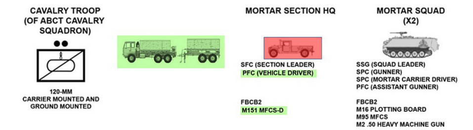
Figure 1. Recommend changes to the ABCT cavalry mortar section. Note for all three figures: Deletions are highlighted in red, additions are highlighted in green. ( Graphic adapted from Army Techniques Publication (ATP) 3-21.90 )