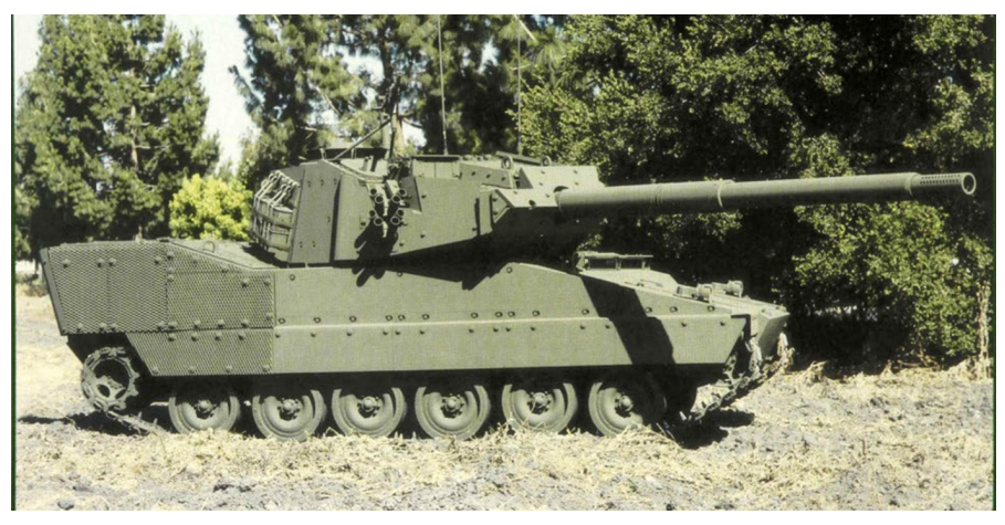
Figure 2. M8 Armored Gun System (AGS) Level 2 armor, circa 1994.