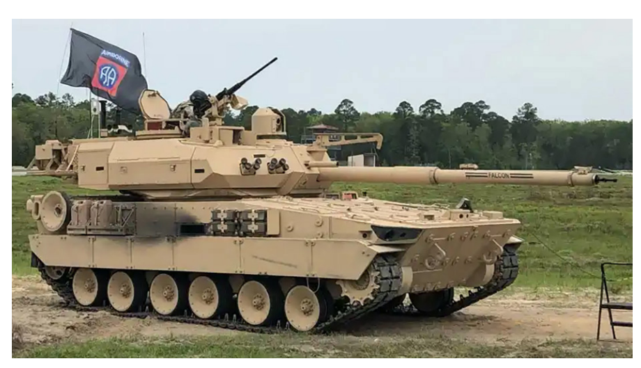
Figure 3. The MPF ground-combat vehicle from General Dynamics Land Systems.

those of M551. "Having [MPF] that can be delivered either by air-drop or air-land enables us to retain the initiative we gain by dropping in," MG Nicholson said. "But if all we are doing is jumping in and then moving at the speed of World War II paratroopers, we are going to rapidly lose the initiative we gained by conducting strategic or operational joint forcible entry."<sup>4</sup>