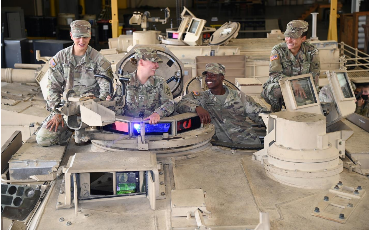
Figure 1. 19K one-station unit training trainees from Company B, 1 st Battalion, 81 st Armor Regiment, take a break during a turret training block of instruction. All 19K trainees receive an orientation to the different duty stations (tank commander, gunner and loader) inside the turret of the tank but receive thorough instruction pertaining to the duties of a tank loader.