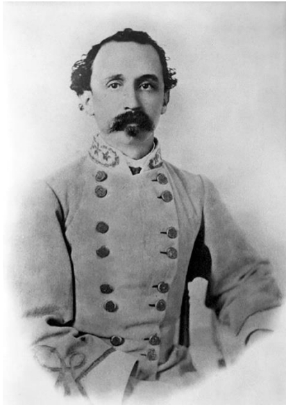
Figure 4. Lawrence Sullivan “Sul” Ross, commander of Texas Cavalry Brigade, in the 1860s.

Known for its most famous commander, former Texas Ranger and future Texas governor Lawrence “Sul” Ross, the brigade would demonstrate a unique tactical versatility on both sides of the Mississippi River throughout a series of exacting campaigns. 11