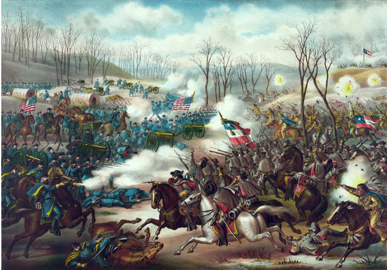
Figure 1. The Battle of Pea Ridge, AR. The 3 rd , 6 th , 9 th and 27 th Texas Cavalry Regiments, Texas Cavalry Brigade, all participated in this engagement. (Art by Kurz and Allison, public domain, created late 1800s.)