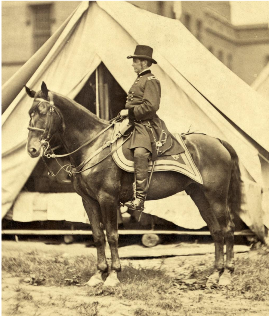
Figure 3. Famed Civil War-era photographer Mathew Brady took this shot of Union GEN Joseph “Fightin’ Joe” Hooker in his campground.

massive engagement. 9 The inconclusive battle, where Union cavalry demonstrated their growing confidence and skill, ended as the largest purely cavalry confrontation of the Civil War.