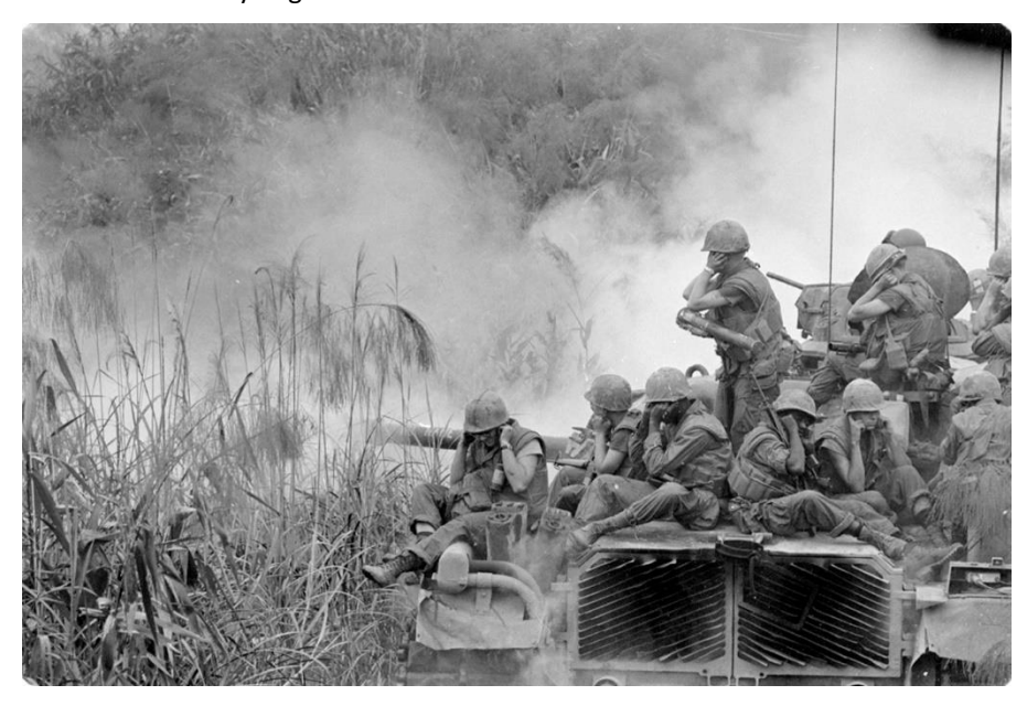
Figure 5. U.S. Marines on tanks during Tet.

The Marines successfully secured the New City by Feb. 10. However, the battle in The Citadel had reached a stalemate. GEN Westmoreland sent 1<sup>st</sup> Brigade, 101<sup>st</sup> Airborne (Airmobile), into the fight, beginning with 1<sup>st</sup> Battalion, 327<sup>th</sup> Parachute Infantry Regiment.<sup>37</sup>