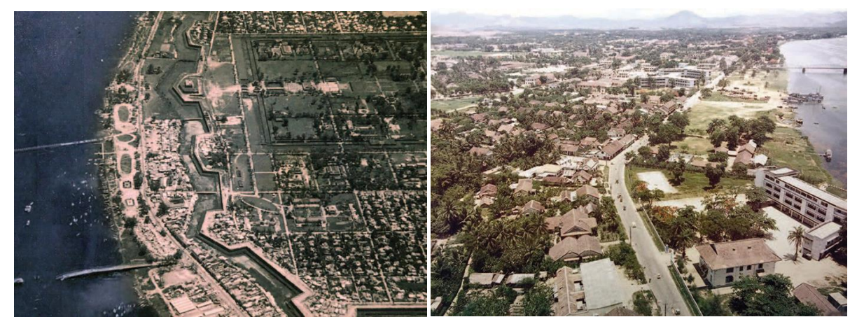
Figures 2a and 2b. Left, The Citadel, and right, the New City of Hue.

Both NVA regiments and support units, only a day's march from Hue, avoided an ARVN airborne TF operating in the area. Forces from the siege at Khe Sanh and the Quang Tri region also moved undetected toward Hue. 15