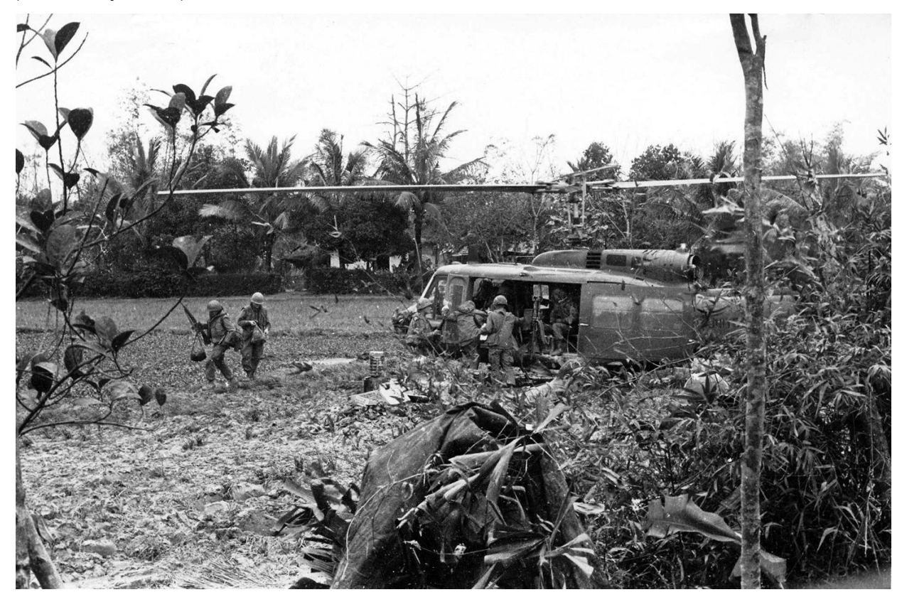
Figure 8. 1st Cavalry Division helicopter resupply mission northwest of Hue Feb. 17, 1968.

science from Pacific Lutheran University and a master's of arts degree in counseling psychology from Chapman College. His awards and honors include the Legion of Merit (one oak-leaf cluster) and Meritorious Service Medal (two oak-leaf clusters).