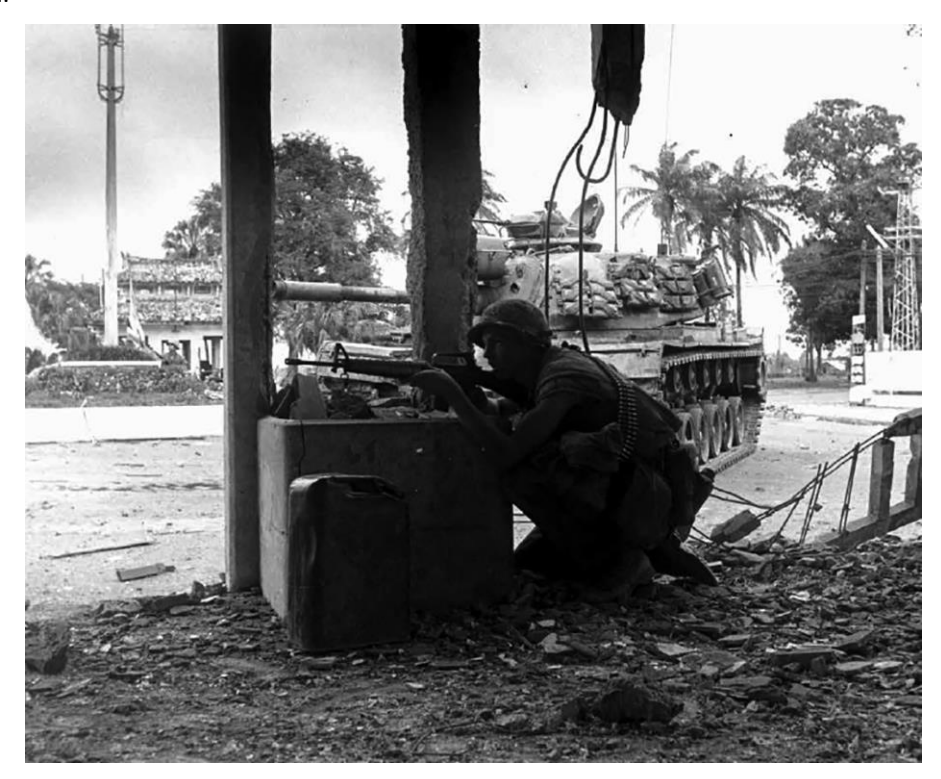
Figure 6. A Marine scans the streets for snipers with an M48A3 Patton tank ready for heavy firepower in the Hue University area.

The following day, the Marines attempted to suppress NVA defenses ahead of their advance with field-artillery fire and naval gunfire from destroyers and cruisers offshore as a rolling barrage ahead of the advance. The naval gunfire's relatively flat trajectory and the proximity of friendly troops to its targets limited its effectiveness. With a break in the weather, F-4 and F-8 fighter-bombers provided CAS. However, its effect was minimal. Because of this, the Marines became more reliant on armor and organic mortars when deteriorating weather precluded CAS and artillery fires. The NVA defenders held the upper hand for the next two days when the Marine and ARVN attack stalled.<sup>40</sup>