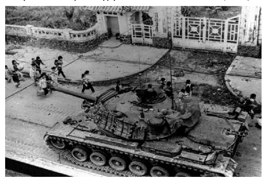
Figure 9. Refugees pass an M48A3. (Photo originally published in ARMOR, May-June 1999)