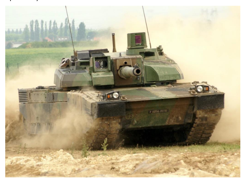
Figure 3. A French Leclerc tank maneuvers.

Also, operations such as forward-passage-of-lines and rearward-passage-of-lines are constructed using delineated lanes and coordination points to promote adjacent unit coordination and synchronized shifting of area of operations responsibility.