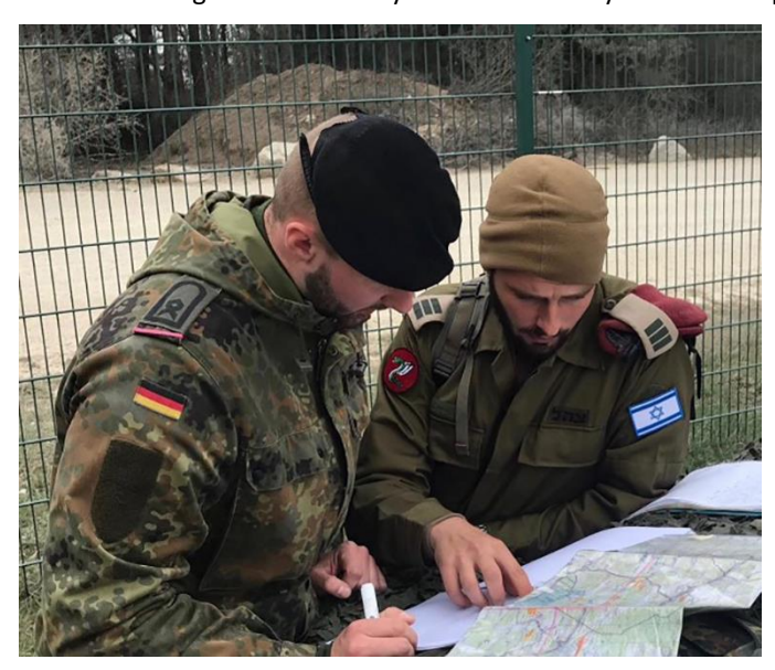
Figure 1. Commanders discuss scheme of maneuver.

To be effectively implemented throughout the planning process, units should focus on the following areas when explaining their capabilities: intelligence-collection procedures, resource constraints and additional support requirements. This will "encourage active collaboration among all organizations affected by the pending operations to build shared understanding" and inevitably lead to a more synchronized operation.