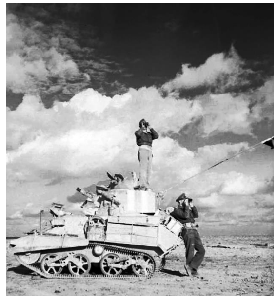
Figure 5. The crew of a Mk VIB light tank look for any movement of the enemy near Tobruk, Nov. 28, 1941.

The action that was to follow in and around Tobruk would see each side gain and lose tactical advantage as their material strength was ground down to bare bones. The New Zealand Division would establish a link-up with the embattled garrison, only to have the siege of Tobruk re-established by a determined 15<sup>th</sup> Panzer Division counterattack from the south of El Duda. Rommel was able to finally drive the New Zealand Division from the field, but the cost in doing so would preclude him from holding his position in Cyenaica.