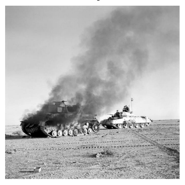
Figure 4. A British Crusader tank passes a burning German Panzer IV tank during Operation Crusader in North Africa Nov. 27, 1941.

full circle as the stage was set for a rematch around the airfield at Sidi Rezegh. Rommel was to override the recommendation of his staff as he looked to engineer a counterattack that would disrupt and prevent the complete link-up and reinforcement between the advancing New Zealand Division and the garrison at Tobruk.<sup>12</sup>