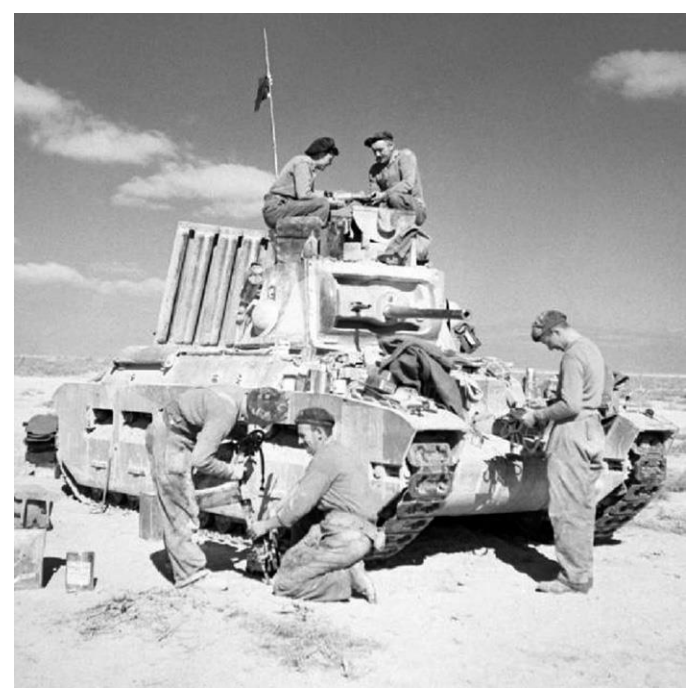
Figure 6. A Matilda tank crew overhauls their vehicle in preparation for the next phase of battle near Tobruk Dec. 1, 1941.

The materiel ramifications of the "dash to the wire" provide a clear indication of the cost of engagement. Rommel spent his final fuel reserves to execute this movement, which reduced his tactical options as the continuing campaign unfolded. On Dec. 5, the Italian Comando Supremo made it clear the supply situation would not improve until the end of the month, when airlift efforts could be initiated from bases in Sicily. In the week that followed Rommel's decision to pull back from the Tobruk front, Afrika Corps was down to eight operational tanks and the Italian Ariete Division could muster 30.<sup>15</sup> This stands in sharp contrast to XXX Corps, who retained their presence on the battlefield and through aggressive recovery efforts were able to return more than 70 tanks to the battle. The balance in armor strength that had been skillfully won in the first phase of Crusader by Axis forces was spent with interest during this follow-on effort.