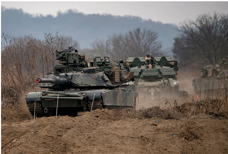
Figure 3. An M1A2 Abrams tank from Company B, 1 st Battalion, 8 th Cavalry Regiment, 2 nd Armored Brigade Combat Team (ABCT), 1 st Cavalry Division, Fort Hood, TX, conducts a situational-training exercise Nov. 13, 2017. Refining the fundamentals of Army doctrine through training – like Company B is doing here in preparation for

I often say that great units master the basics, and training management is no different. Remember that training is a journey, not a destination. By embracing the fundamentals of our doctrine through education in our institutions and refining them through training and building experience in the operational force, we will regain this important proficiency. Through the disciplined execution of UTM, we will gain and maintain readiness in the fielded force and set the conditions for our transformation to the MDO capable force of the future.