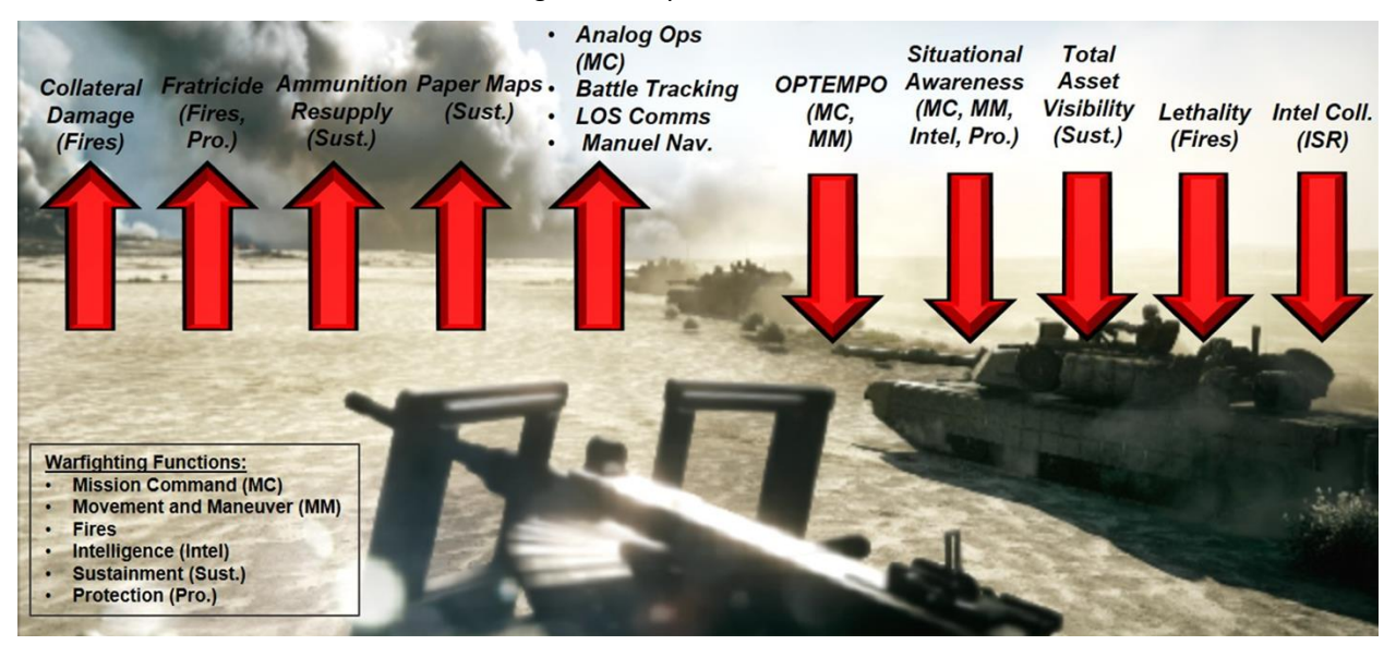
Figure 1. D3SOE is a condition of the operational environment. D3SOE increases the occurrence of or need for certain events (up arrows) and impacts operations by decreasing formation efficiency (down arrows).

The intent of this article, "Demystifying Space," is to bridge the gap among the space domain, the operational environment, future force modernization and current maneuver formations that require a higher level of space skills. The reality is that our Soldiers and formations cannot wait for the next big space program of record to provide overmatch against peer and near-peer adversaries. Being able to "fight tonight" requires addressing the problems of a denied, degraded and disrupted space operational environment (D3SOE) in a contested, multi-domain extended battlefield environment against today's threat.