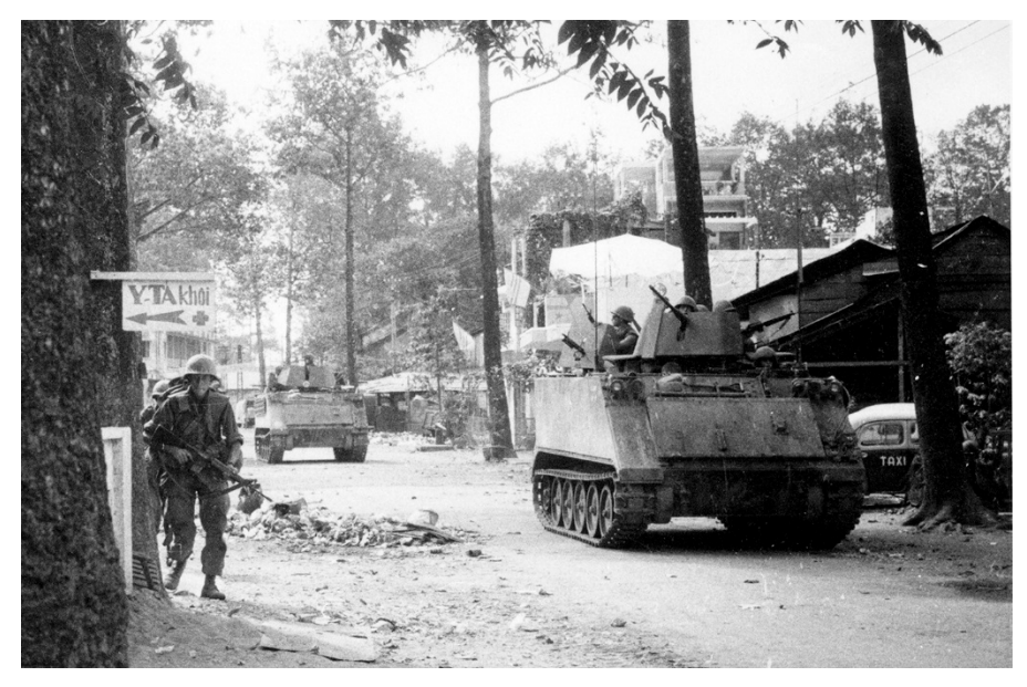
Figure 1. M113s in Armored Cavalry Assault Vehicle configuration move into Saigon during the 1968 Tet Offensive.

In Vietnam, this design philosophy fared little better. The Army of the Republic of Vietnam (ARVN) employed M113s in counterinsurgency operations against the Viet Cong (VC). Dismounting from their carriers and advancing on foot, ARVN soldiers found that the VC simply withdrew before they could be engaged. The ARVN responded through the employment of their M113s in a tank-like role, conducting mounted assaults without stopping to dismount passengers. These tactics proved much more successful, but they resulted in high casualties among unprotected vehicle machinegunners. Field modifications resulted, adding more machineguns and gunshields — alterations that U.S. combat forces later adopted.<sup>2</sup>