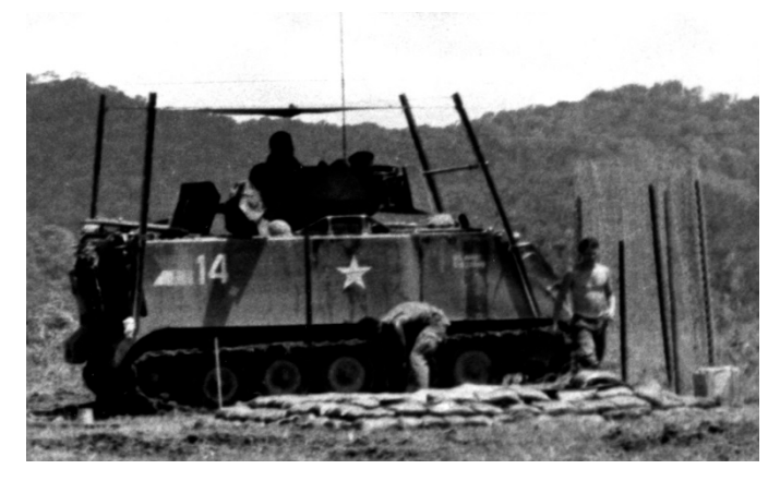
Figure 3. An M113 behind chain-link fencing intended to prematurely detonate incoming RPG rounds.