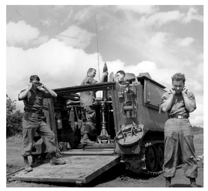
Figure 5. M113 mortar-carrier variant.

The highly publicized fighting in Fallujah in 2004 also witnessed the successful employment of the M113. However, this perception of success derived in part from the humvee's high loss rate. The M113's minimal armor still provided better protection than the unarmored humvees. By late 2004, humvee loss rates had reached unacceptable levels, which was accompanied by a growing number of related casualties. Congress recommended re-equipping Soldiers with M113s until enough numbers of uparmored M1114 humvees and mine-resistant, ambush-protected vehicles became available. In 2005, the Army opted to send more than 700 M113A3s to Iraq. Survivability enhancements included hardened side armor, slat armor, belly armor and a transparent gun shield.<sup>16</sup>