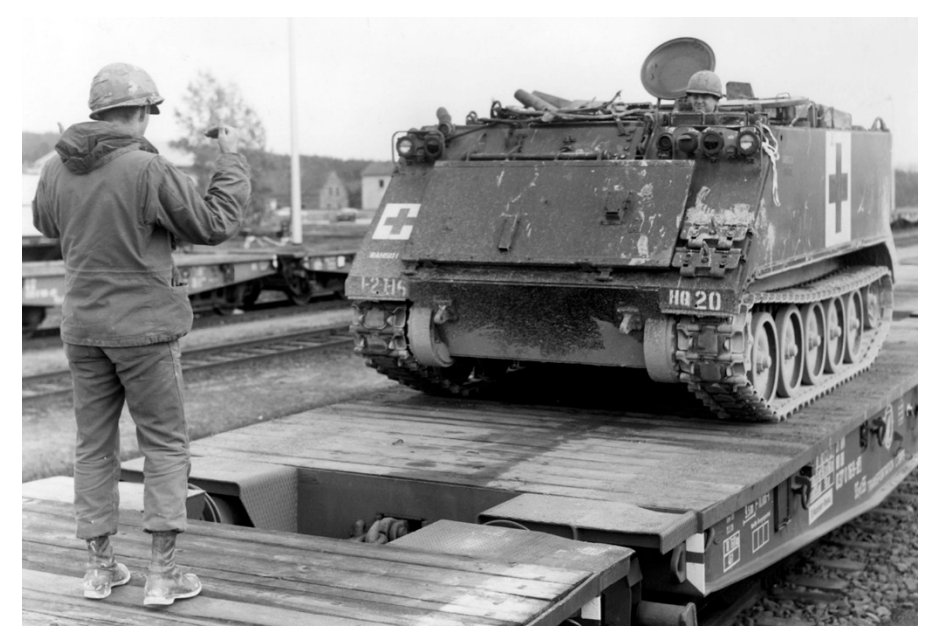
Figure 6. M113 ambulance variant.

Despite its early success relative to the humvee, the M113 remained vulnerable. It was not optimized for operations in close, complex terrain against an adaptive enemy employing a mix of conventional and unconventional attacks at close range. Survivability concerns increased as the capabilities of terrorists and insurgents in Iraq grew, eroding still further the M113's utility. In response, the Army awarded a contract to upgrade more than 300 M113s to the A3 standard. The specific variants addressed included the M577 command post carrier, M1064 mortar carrier and the M1068 standard integrated command-post carrier. However, this contract only upgraded about 40 percent of the M113 fleet. The vehicle was considered "not suitable for an era of persistent conflict due to survivability shortfalls and space, power and weight constraints." The rising threat level effectively stranded the M113 on forward operating bases and underscored its obsolescence.<sup>19</sup>