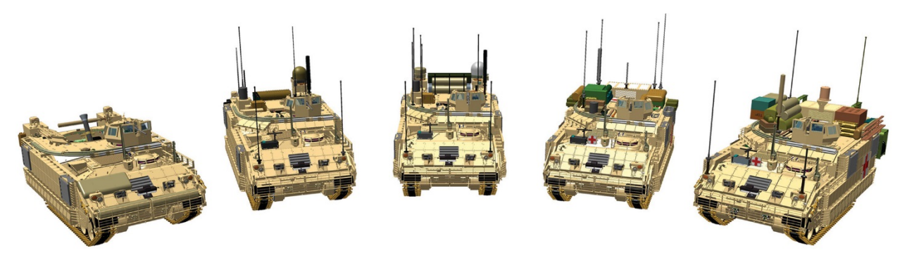
Figure 9. Artist depiction of the AMPV variants. From left to right, they are the mortar carrier, general-purpose, mission command, medical evacuation and medical treatment vehicles.

For Soldiers assigned to M113s in the ABCT, AMPV fielding dates in the 2020s mean little. They serve in an obsolescent platform whose vulnerabilities are common knowledge to friend and foe. Nor is their longevity improved by the M113's deadly combination of a specialized role and minimal ballistic protection. The vehicle is a lucrative target whose loss will impair parent unit operations.