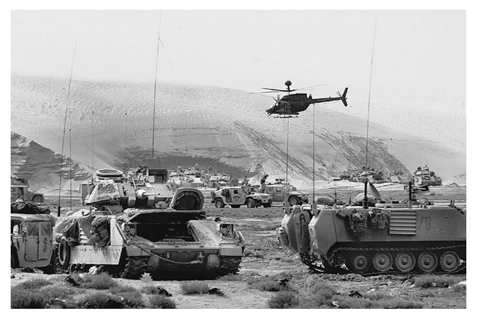
Figure 8. M113A3s from 3-7 Cavalry during the invasion of Iraq in 2003.

In addition to simplified vehicle and organizational sustainment, the AMPV offers advantages in space, power and cooling over the M113. The AMPV provides more internal space and boosts electrical power through the inclusion of two 400-amp generators. This combination of space and power capacity enables the new vehicle family to carry the latest digital-networking systems and support future upgrades. These improvements benefit all the AMPV variants. They are especially valuable to the mission-command platform, which possesses the means to collect and share data while remaining forward with combat elements. It constitutes a critical command-and-control node whose digital-networking systems facilitate data analysis and command decisions. Similarly, improved survivability permits the medical-evacuation variant to recover casualties from forward areas.<sup>28</sup>