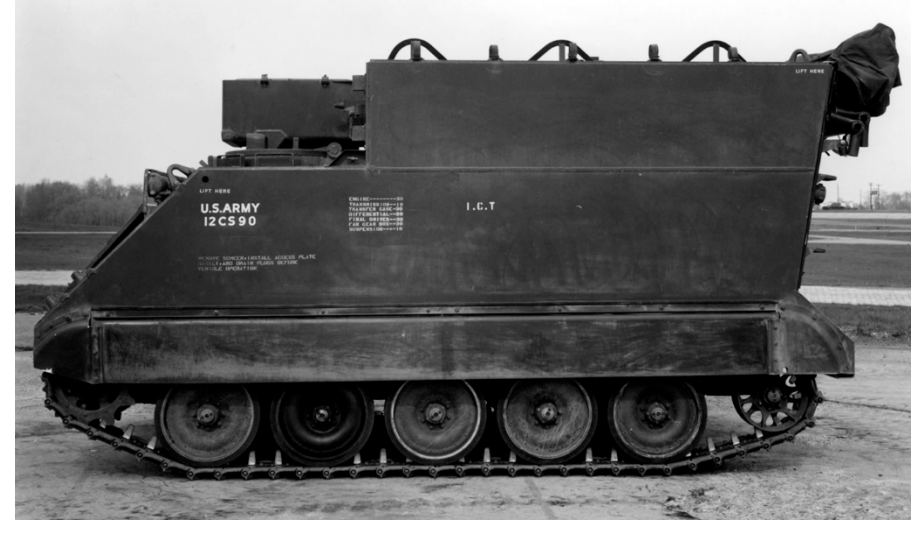
Figure 4. M577 command-post vehicle.

These problems led the Army to consider alternatives, especially the Command-and-Control Vehicle. Built on a Bradley chassis, it significantly upgraded the ability to operate on the move and matched the mobility of the Abrams/Bradley team. However, the Army cancelled the program in 2000 before production began.<sup>11</sup>