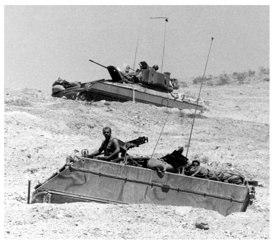
Figure 7. M113 and M3 Cavalry Fighting Vehicle in battle positions at the National Training Center.

Russian military experience also suggested the need to improve the survivability of support vehicles. During fighting in the Chechen capital of Grozny in 1994-1995 and again in 1999-2000, Chechen fighters exploited the nonlinear, urban battlefield to attack vehicles from multiple heights and directions. Mobile ambushes, RPG "showers," sniper attacks and extensive use of mines served to damage and destroy Russian vehicles and restrict their freedom of maneuver. The Chechens further deliberately targeted combat-support and service-support vehicles and personnel, noting the adverse impact of such attacks upon Russian morale and combat effectiveness. During the initial battle for the city, the Russians lacked an ambulance with sufficient survivability to evacuate casualties from combat zones. They resorted to the improvised use of the bronetransportyor (BTR) 80 in this role, though survivability concerns limited casualty evacuations to the hours of darkness. In 1999, the Russians employed the tracked boyeva mashina pekhoty (BMP) as an armored ambulance. However, both platforms remained highly vulnerable to Chechen attacks, particularly from the sides, top and rear.<sup>22</sup>