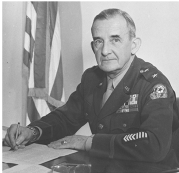
Figure 1. Albert Kenner as a major general. He is wearing the European Theater of Operations-Advanced Section shoulder-sleeve insignia.

One of Kenner's first steps was to request money to, as he described it, "study the human equation in ... armor and vehicles used by armored forces. ... I thought that a tank might be likened to occupational hazard and studied it from that standpoint. The tanks originally had been built without reference to the crews." 1 He laid out a long list of research topics: removal of the injured, ventilation, carbon-monoxide exposure, visual disturbances, flash burns, fatigue, postural hazards and injuries, head injuries, whiplash, tinnitus, rations, excessive temperature, dust, belt supports for back and trunk, sudden decompression, even blast effects from landmines. Kenner's commander, MG Jacob Devers, concurred in December 1941; Secretary of War Henry Stimson approved in February 1942; the National Research Council granted $300,000; ground was broken in March 1942; and the building (still being completed) was occupied in September 1942.