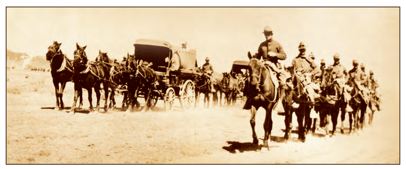
"In 1916, the conflict spilled over the border when Pancho Villa, the leader of an anti-American faction, attacked Columbus, New Mexico. The United States responded by sending a 5,000-man column into northern Mexico after the raiders. The column included cavalry, trucks, and aircraft to support ground troops. This action became known as the 'Punitive Expedition.'"

alry units used scouts to track the raiders and apply pressure on them. Although contacts proved infrequent, the relentless pursuit tactics often forced the raiders to surrender, starve, or fight in unfavorable circumstances. In these campaigns, conducted under difficult conditions in an unforgiving climate, the 9th and 10th Cavalry Regiments played a prominent role. These regiments were composed of African-American soldiers and noncommissioned officers led by white officers. Their habit of wearing buffalo robes earned them the nickname "buffalo soldiers."