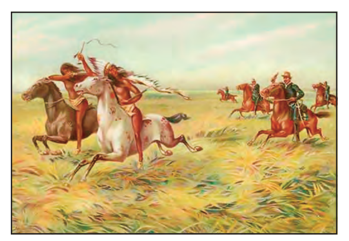
"In the colonial era, America's mounted force consisted of militia mounted on horses to cope with Indian raids or serve with the British in their conflicts with the French in North America. In this early period, the heavily wooded terrain of the continent and a small population restricted the size of cavalry units and the extent of their operations."

The Civil War firmly established the basic cavalry missions of reconnaissance, security, economy of force, exploitation, pursuit, delay, and raid. The war also demonstrated the supremacy of fire-power over the mounted charge. Cavalry units tended to use their horses for transport and fight dismounted, conducting mounted assaults only against surprised or broken forces. These same principles found widespread employment in the decades following